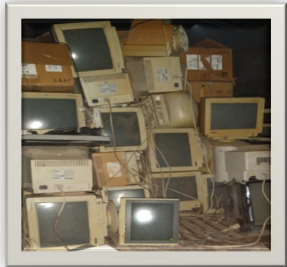
Condemned Systems Collection at College